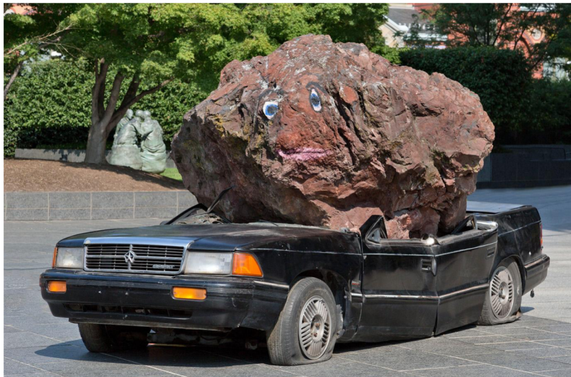
Jimmie Durham, Still Life with Xitle and Spirit